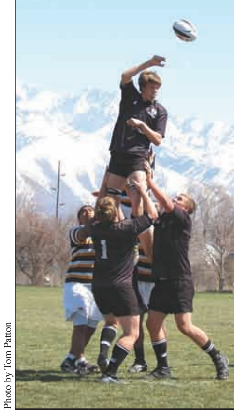
Highland Rugby club aiming for further heights from new practice home at Granite High. Highland players seen here on a line out throw from a recent game against Skyline.

"I have found that players and parents appreciate the teaching of moral values," he said. "If this were only about rugby, I would have retired years ago."