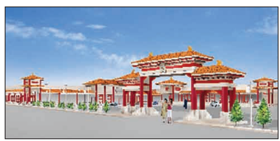
A conceptual drawing of what the proposed Chinatown development will look like when completed in early 2009.