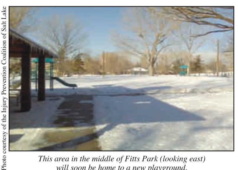
This area in the middle of Fitts Park (looking east) will soon be home to a new playground.